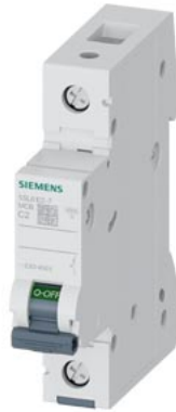
Miniature circuit breaker 230/400 V 6kA, 1-pole, C, 2A